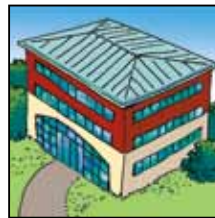
At your office . . .

PROS: Live digital feed and 24/7 Internet access for the next six months; accessible in the office, at home or anywhere worldwide with Internet access; avoid travel expense and hassle; no time away from the office.