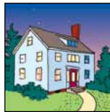
. . . or home